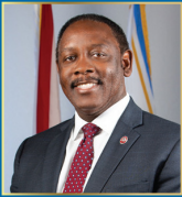
Orange County Mayor Jerry L. Demings